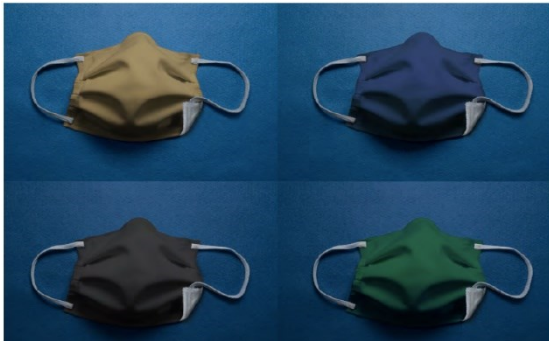
With elastic ear ring